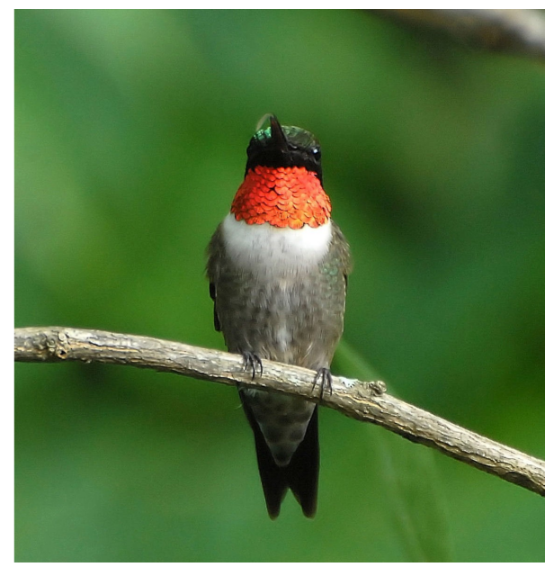
Ruby-Throated Hummingbird